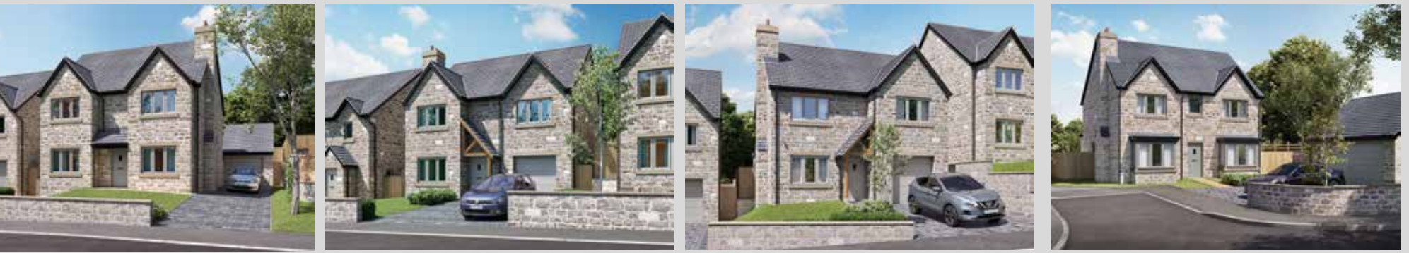
BLACKTHORN 4 BED / DETACHED