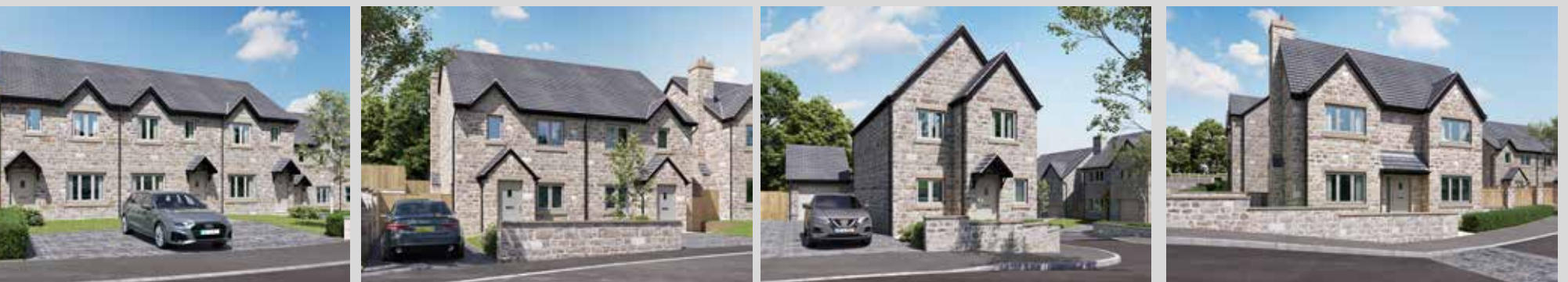
BILBERRY 3 BED / TERRACE *Part Buy | Part Rent